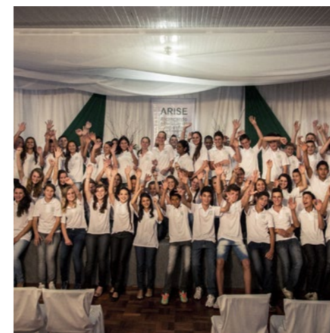
Model Farm School Certificate Ceremony, Brazil

Women in rural areas are a focus of our efforts because they are often more economically fragile. The three areas of our economic empowerment activities focus on Model Farm Schools, income-generating activities, and the distribution of conditional grants.