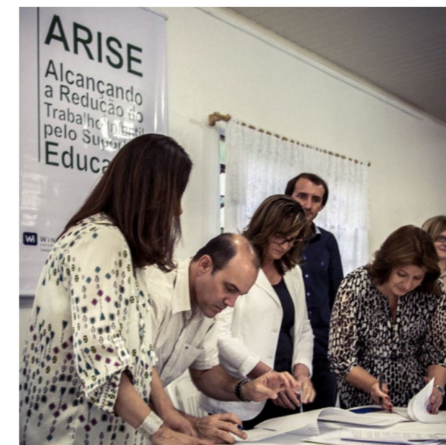
Signing off the ARISE extension in Sobradinho community

development agencies to develop public policies and funds in four strategic areas – education, health, social assistance, and agriculture. The objective is to economically empower communities and to eventually contribute to the reduction of child labour in the tobacco supply chain. In Malawi we coordinated two meetings at which ARISE implementation partners shared progress and ways that they can collaborate to address gaps in regulations and policy.