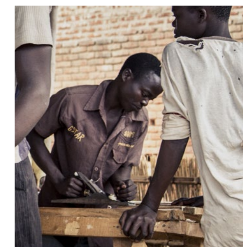
Vocational training center, Ntcheu, Malawi