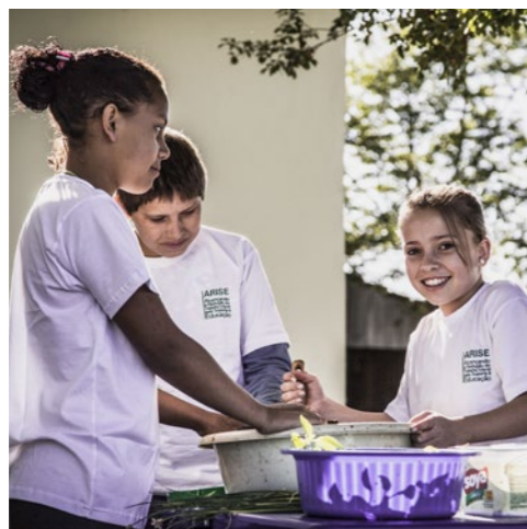
Afterschool gardening in Arroio do Tigre, Brazil

ARISE aims to prevent and eliminate child labor by working with communities in Brazil, Malawi, and Zambia. We are already creating impact. Our key achievements are highlighted below.