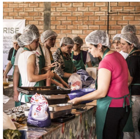
Income generating activities, Brazil

Through the business proceeds the mothers have also been able to support 21 other non-ARISE vulnerable children in their village, and have bought additional play equipment for the children's afterschool program.