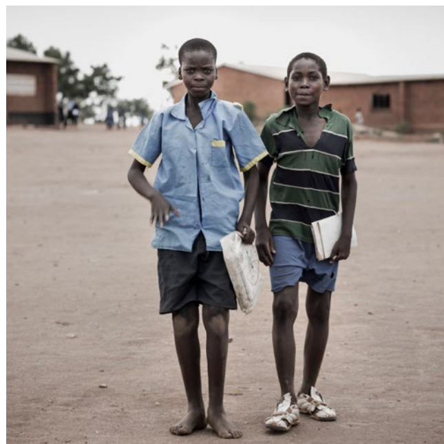
School boys, Kaoma District, Zambia